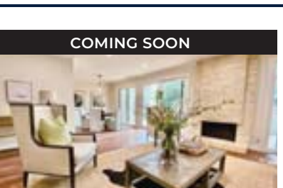
1937 ASPENRIDGE CT., WALNUT CREEK CALL AGENT FOR PRICE