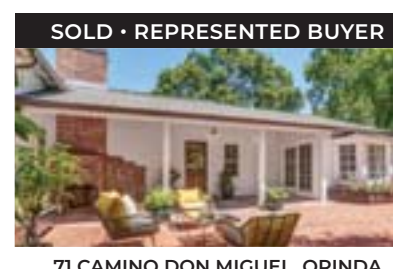
71 CAMINO DON MIGUEL, ORINDA SOLD FOR $1,970,000